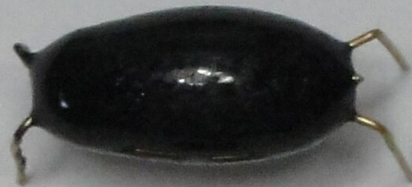
HOME BREW, ENCAPSULATED & POTTED IN METAL TUNE, NOV 1974